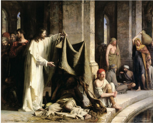
Bloch, "The Pool of Bethesda"