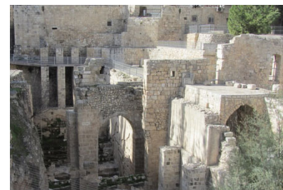
18. The Divine Son: Jesus in John