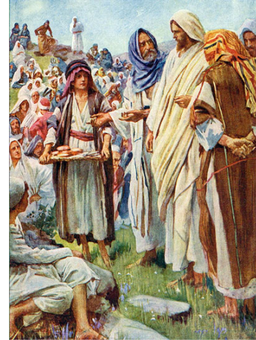
Feeding The Five Thousand by Harold Copping