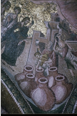
18. The Divine Son: Jesus in John